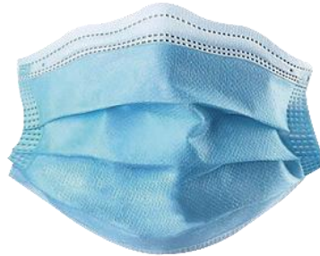
3 Ply Disposable Medical Masks (x1)