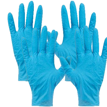
Medical Nitrile Gloves (x 2 Pairs)

Inner and outer layer : 22GSM SBPP non-woven materials Center Layer : 20-25 GSM Bacteria filtration: min. 95% Particle filtration: min. 98% Pressure differential (Delta-P): Max. 2.0 mm/sq, Skin irritation : Negative Particles (>0.3 Micron) : < 100 each (Dry Flex Test), Latex free, ideal for sensitive skin, Fiberglass free; High filter efficiency, Disposable