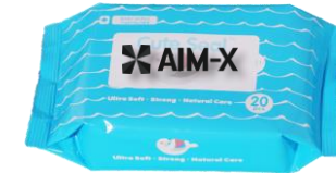
Disinfecting Wipes (x3)

Specifications: Latex Free Disposable Powder Free Non-Sterilized