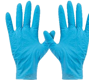
Medical Nitrile Gloves (x 1 Pair)

Inner and outer layer : 22GSM SBPP non-woven materials Center Layer : 20-25 GSM Bacteria filtration: min. 95% Particle filtration: min. 98% Pressure differential (Delta-P): Max. 2.0 mm/sq, Skin irritation : Negative Particles (>0.3 Micron) : < 100 each (Dry Flex Test), Latex free, ideal for sensitive skin, Fiberglass free; High filter efficiency, Disposable