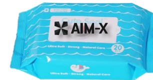
Disinfecting Wipes (x3)

Specifications: Latex Free Disposable Powder Free Non-Sterilized