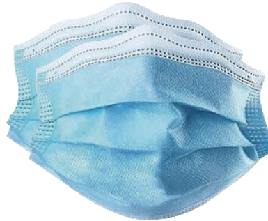
3 Ply Disposable Medical Masks (x2)